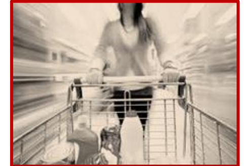
FMCG and Fashion