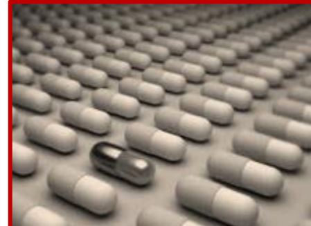
Healthcare and Life Sciences