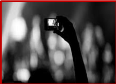
Media and High Tech Electronics